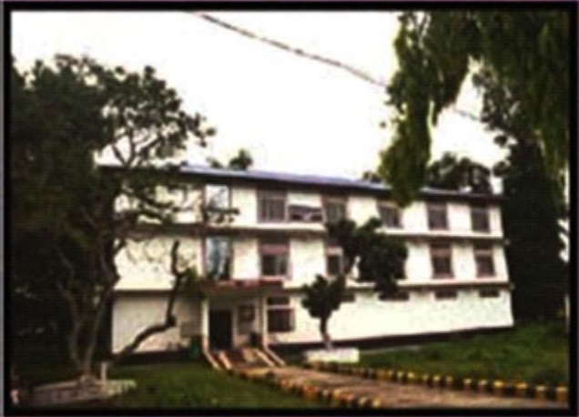
Ratnakanta Barkakati Central Library