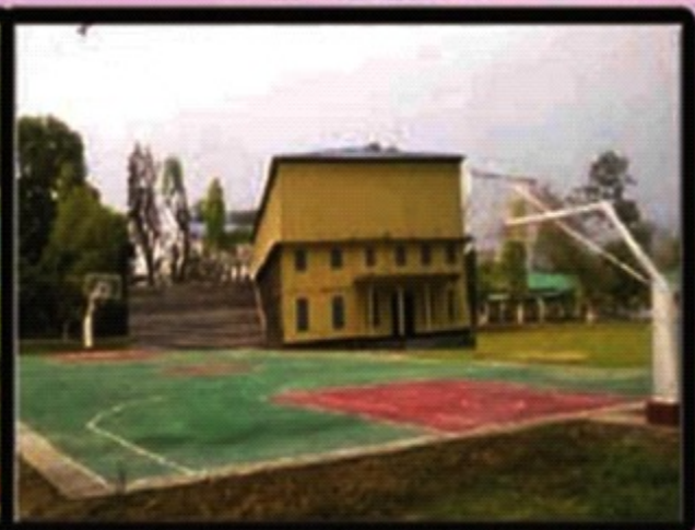
Indoor Stadium & Basketball Court

Published by: Principal, Dhing College, Dhing :: Nagaon :: Assam, Ph. No.: 03672-295809