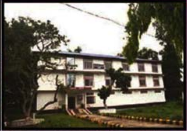
Ratnakanta Barkakati Central Library