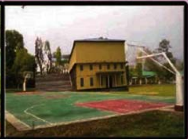
Indoor Stadium & Basketball Court

Published by: Principal, Dhing College, Dhing :: Nagaon :: Assam, Ph. No.: 03672-295809