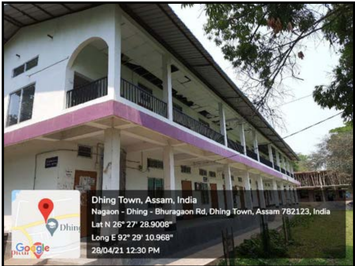
New Academic Building