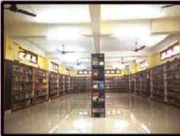
Text Book Section of Library