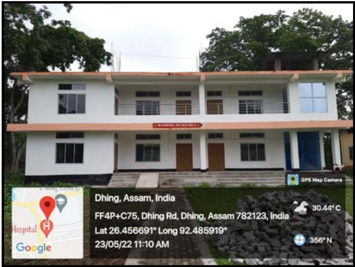
RUSA 2.0 Building