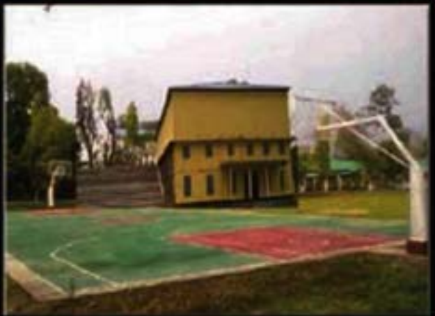
Indoor Stadium & Basketball Court

Published by: Principal, Dhing College, Dhing :: Nagaon :: Assam, Ph. No.: 03672-295809