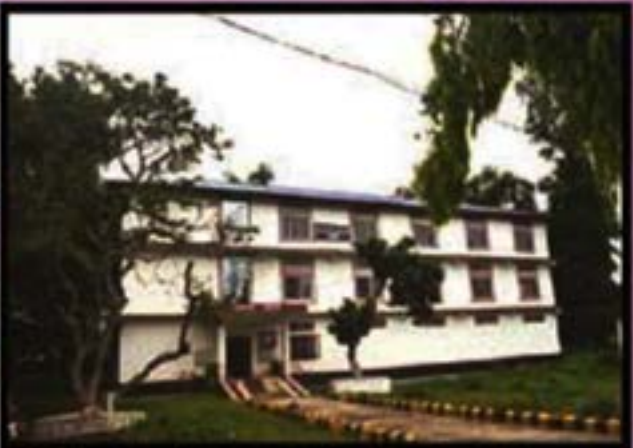
Ratnakanta Barkakati Central Library