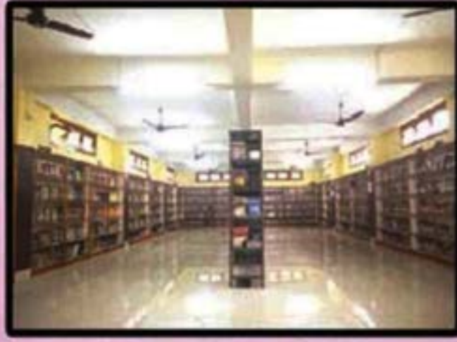
Text Book Section of Library