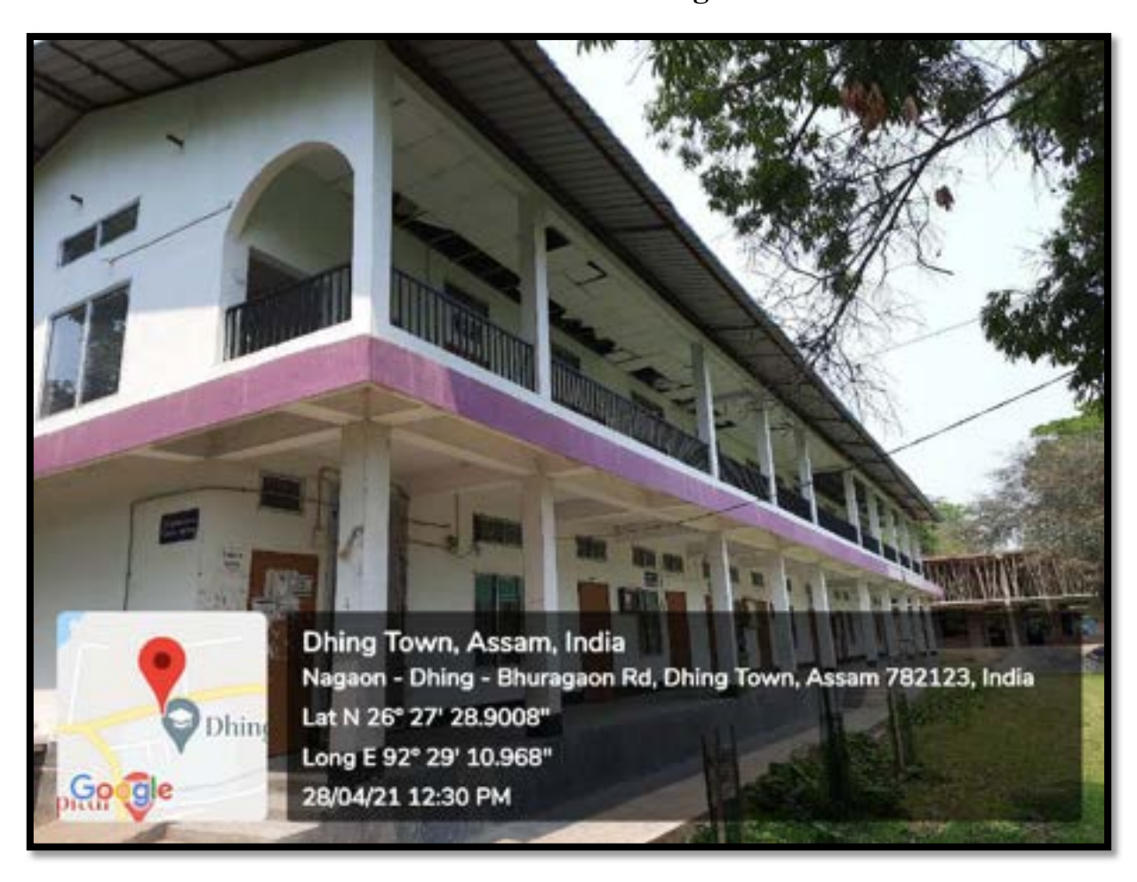
New Academic Building